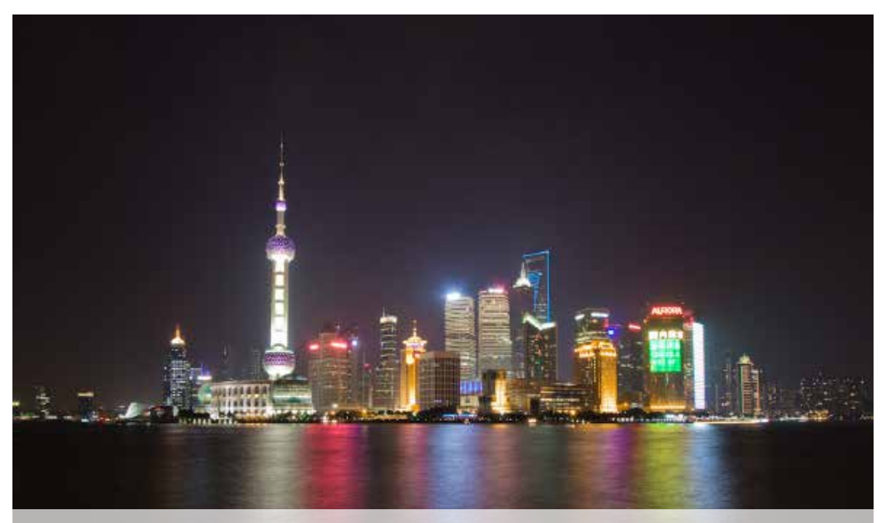
The Bund: waterfront area, symbol and landmark of Shanghai