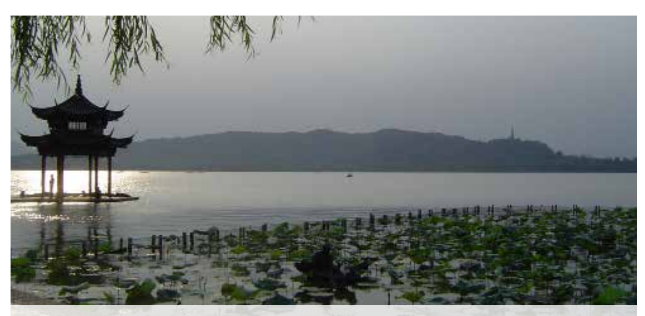
West Lake: Freshwater lake listed as UNESCO World Heritage Site, inspired art and poetry in the ancient and modern periods of China.

If you are interested in reading more about traveling in China, you may ask us or visit Chinarelated tourist sites, such as <a href="http://www.lonelyplanet.com/china">http://www.lonelyplanet.com/china</a>