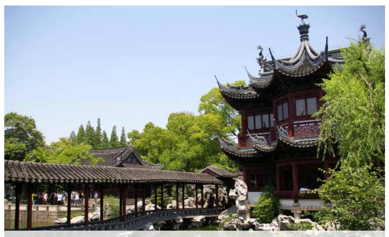
Yuyuan Garden: classical Chinese garden located in city center of Shanghai in the Old City of Shanghai neighborhood