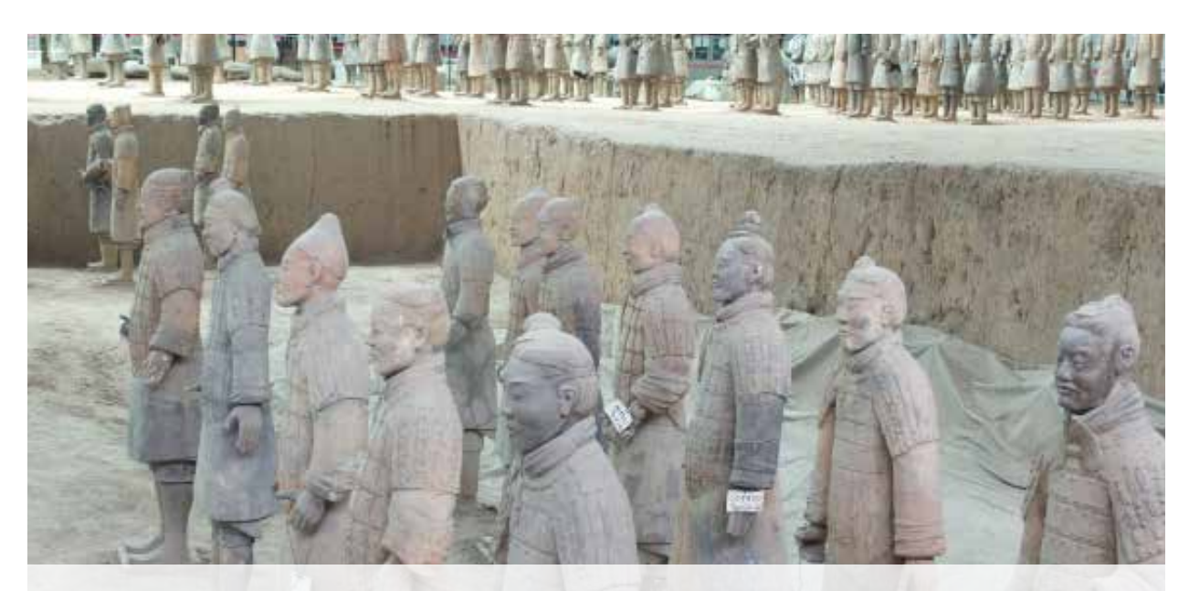
Terra Cotta Warriors: Gigantic mortuary objects buried with the first emperor of China in the third century BCE.