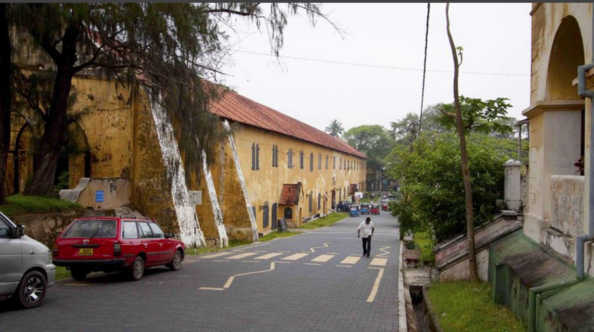
Old Portuguese quartier