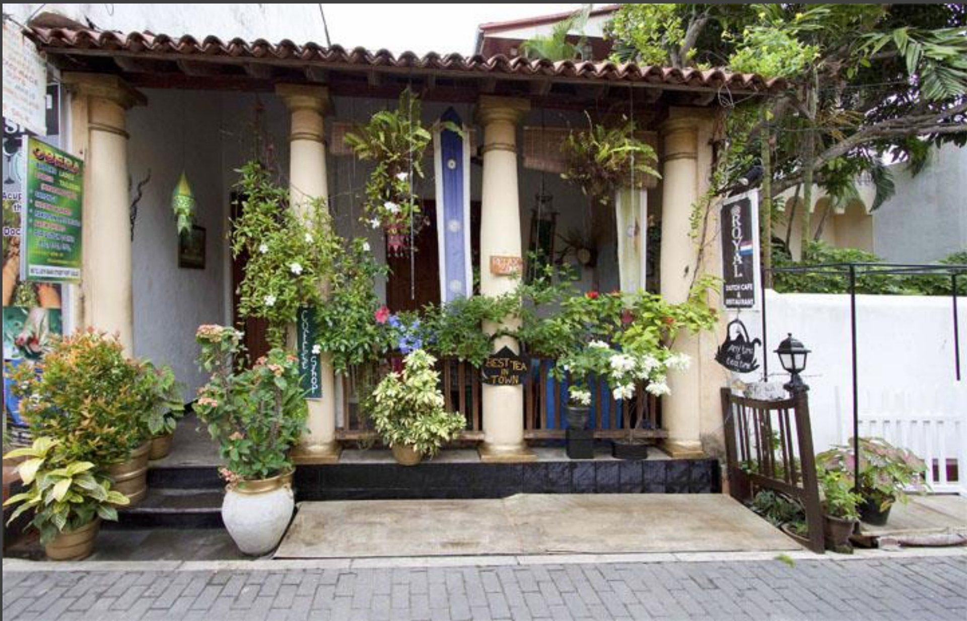
A cute tea house – or coffee house – or a place to relax and have a meal