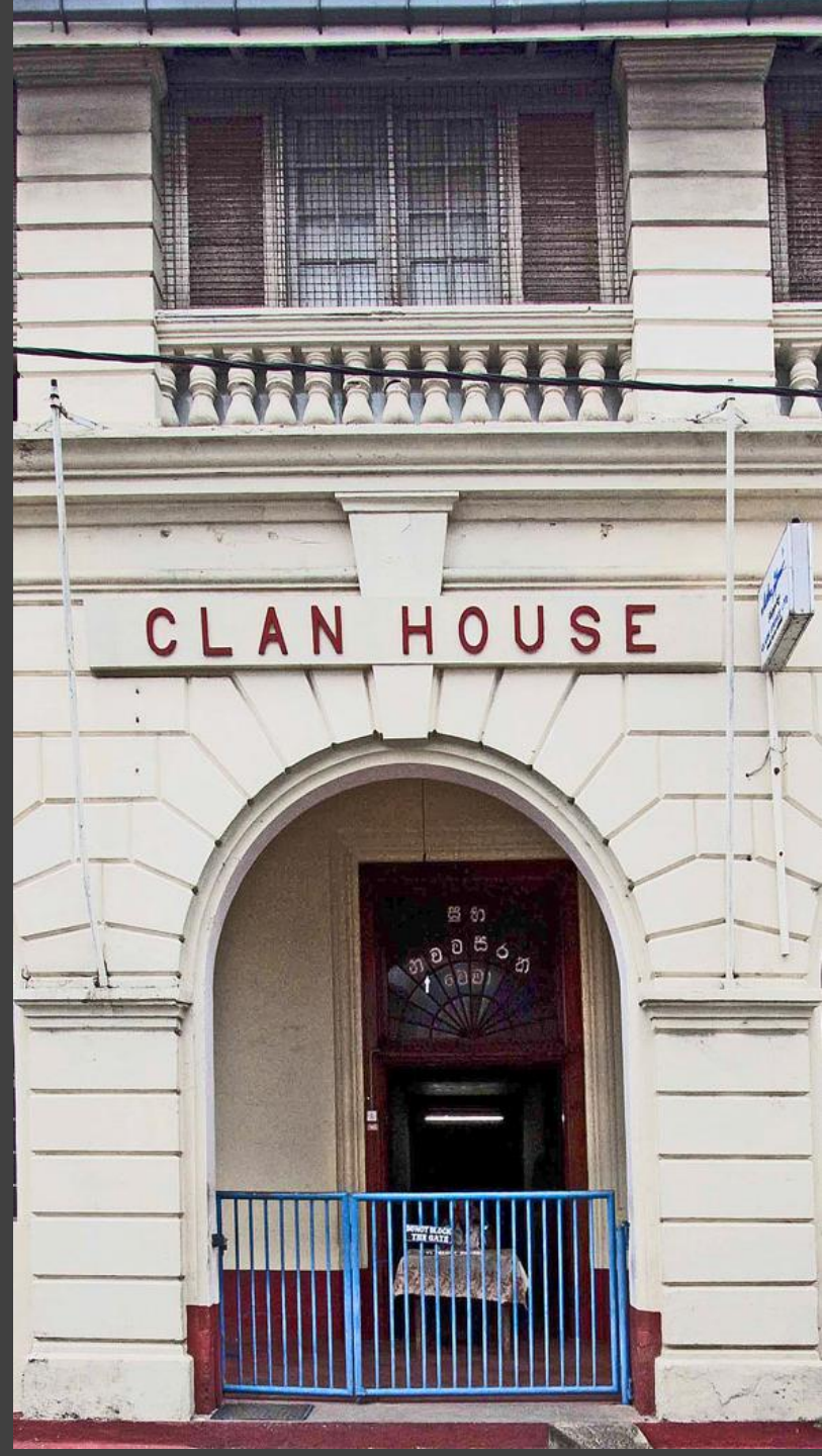
Right: note the front doorway in this great old building