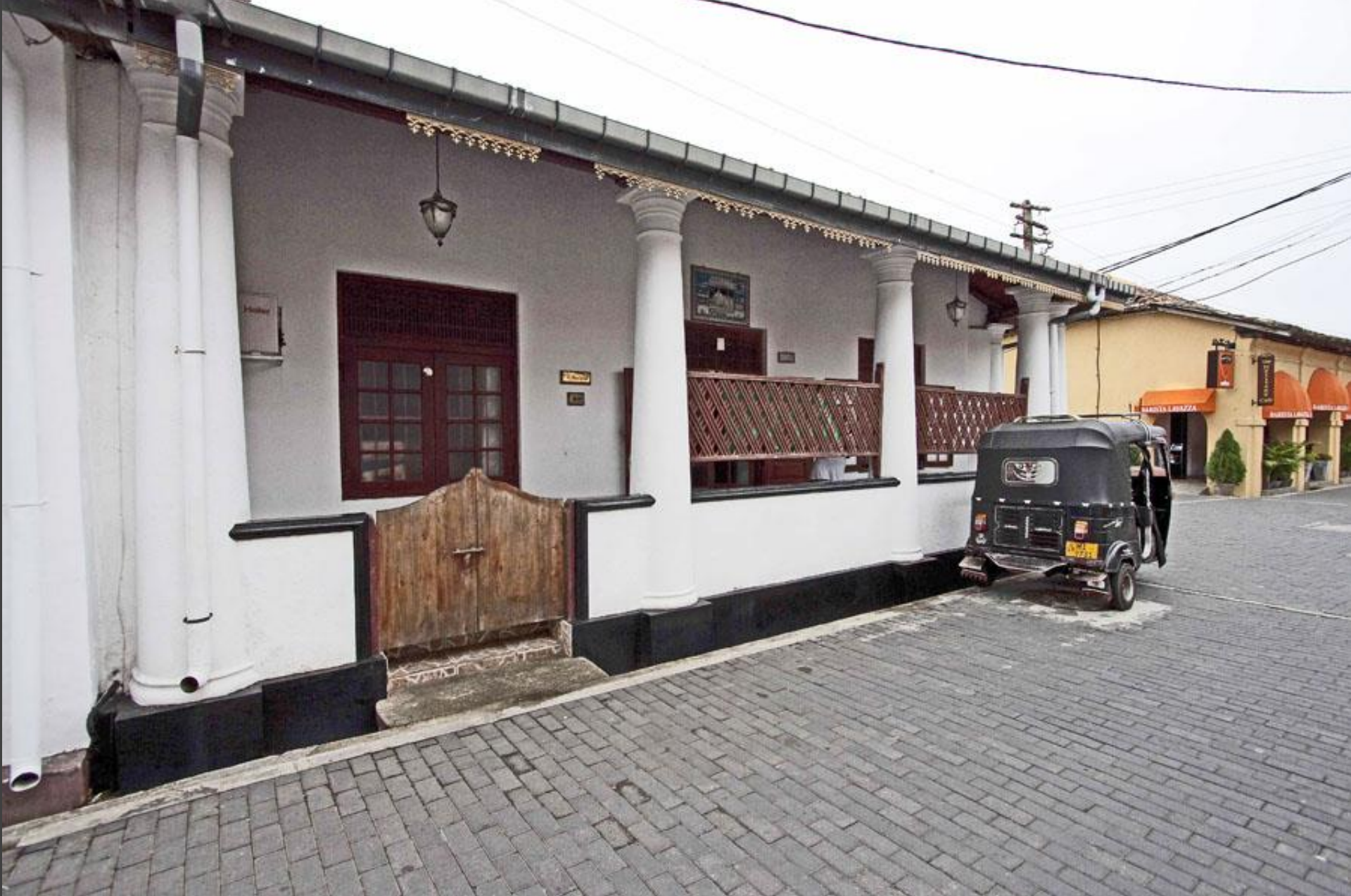
Houses converted into tourists lodges. Whilst maintaining the charm of the past in building design. Note: the hanging lamps.