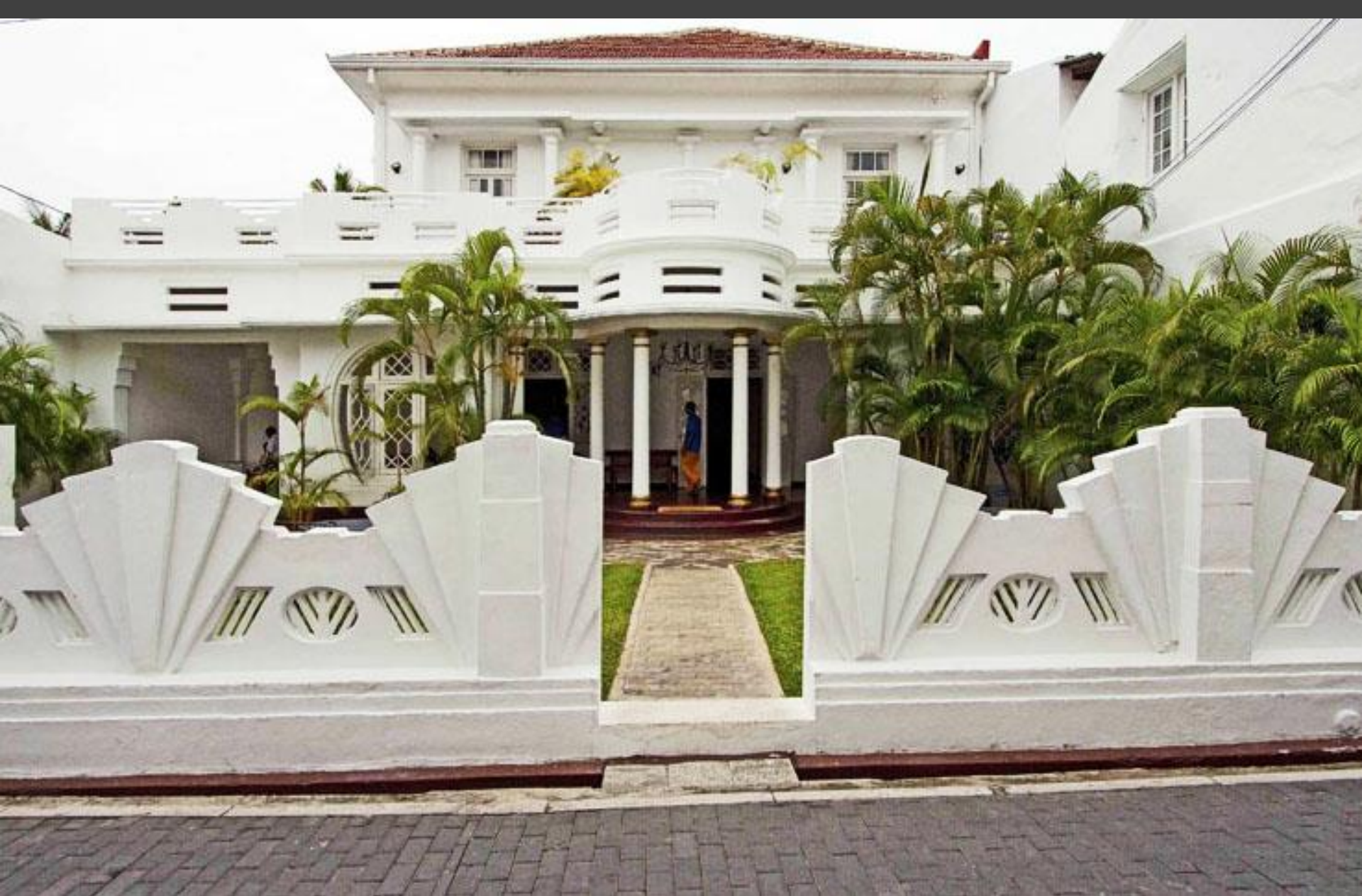
A great old style house – love the “fan design’ on the boundary walls.