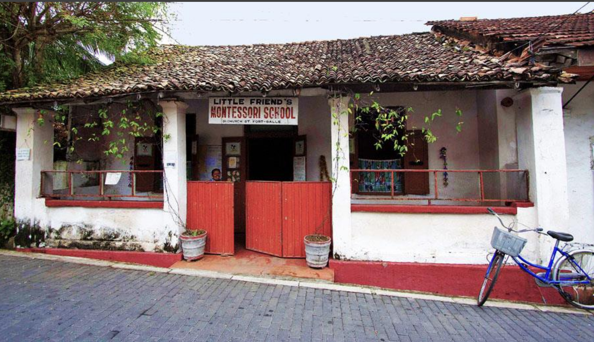
The Little Friends Montessori School