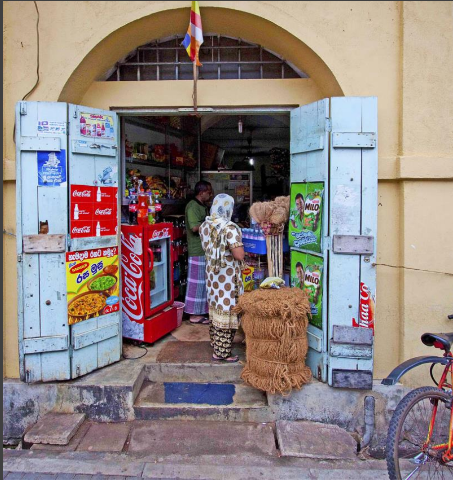
I think this Kade` is in a historic building. One of the contrasts of life in the Fort.