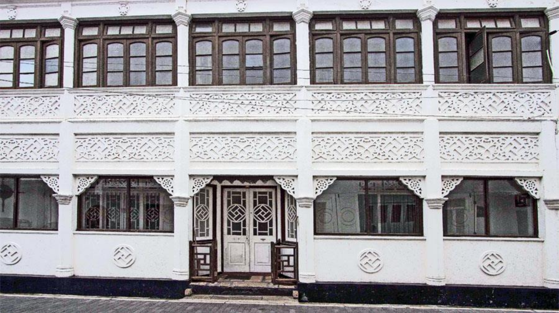
One example of the different architectural designs in The Fort. Intricate brick work and door design