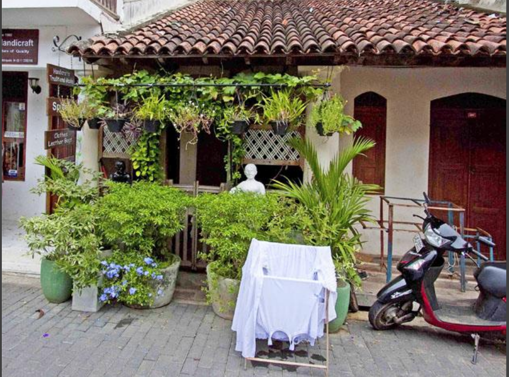
Small businesses cater to all levels of tourism needs