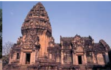
Phimai Historical Park