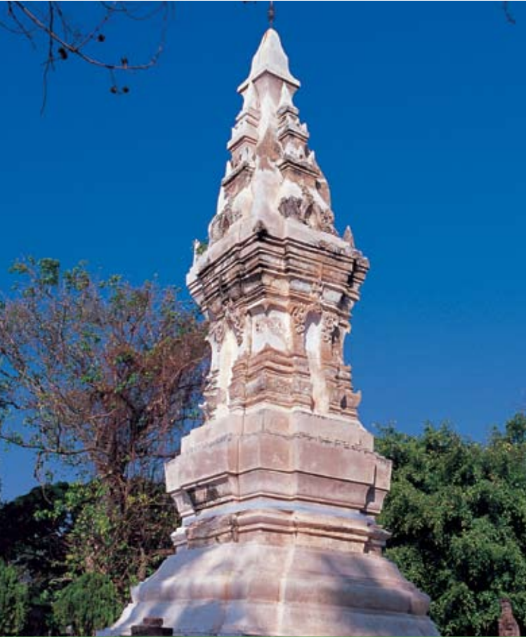
Phrathat Kong Khao Noi, Yasothon