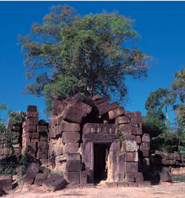
Temple of Ruins Preah Vihear

Held at the Somdet Phra Srinagarindra Park when the Lamduan flowers are in full bloom, the festival includes cultural performances by four different ethnic groups: the Khmer, Suai, Lao, and Yoe, a light-and-sound presentation about the city's founding, and handicraft sales.