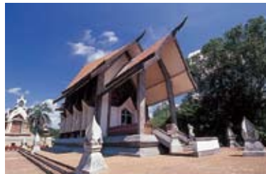
Wat Sala Loi

In the northeast of the city, 500 metres from Rop Mueang Road, the temple is most notable for its preaching hall designed in the shape of a sailing junk, which was awarded the prize as the best avant-garde religious building from the Siam Architects Society in 1973. Enshrined here is a large standing white Buddha image. On the front of the door is a plaster sculpture of Thao Suranari sitting and praying in the middle of a pond.