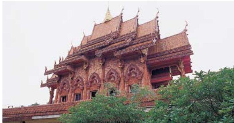
Wat Phukhao Kaeo

Reached via Highway 2222, the 20,000 acre national park contains interesting rock formations and waterfalls, notably the attractive Kaeng Tana cataract.