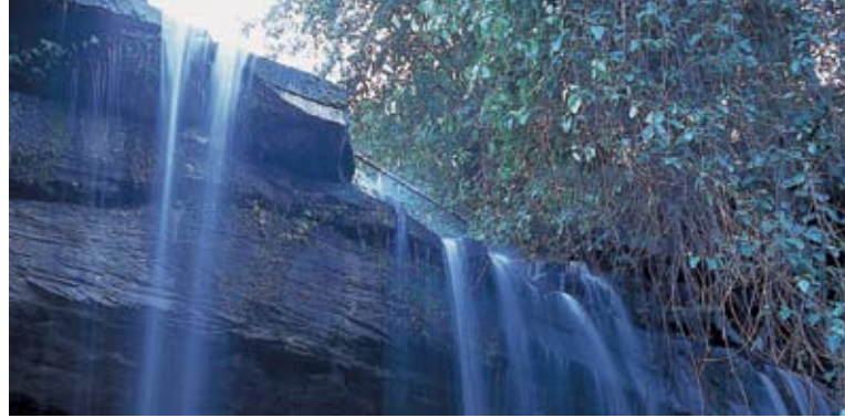
Namtok Samrong Kiat and Namtok Huai Chan