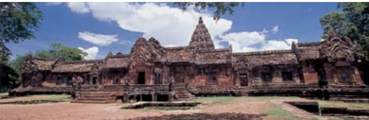
Phanom Rung Historical Park