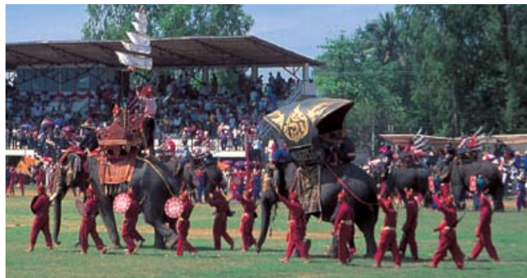
Surin Elephant Roundup

Trains depart from Bangkok's Hua Lamphong Railway Station to Surin daily. Tel: 1690, 0 2220 4334 Website: www.railway.co.th