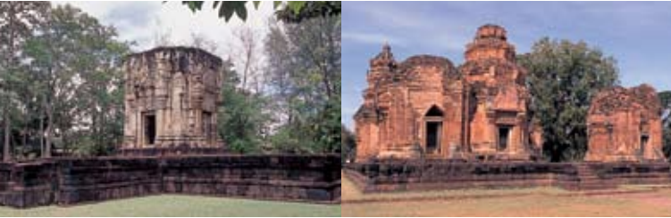
Prasat Hin Ban Phluang