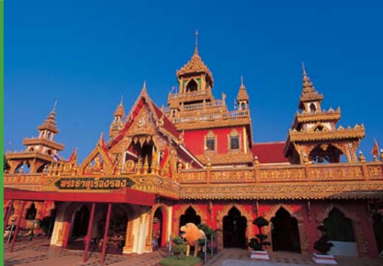
Phrathat Rueng Rong

Located 8 km. from town on Si Sa Ket-Yang Chum Noi Road, the site has a traditional design and is used for religious ceremonies. There is also a museum with cultural displays relating to I-san's ethnic minorities such as the Lao, Khmer, Suai, and Yoe.