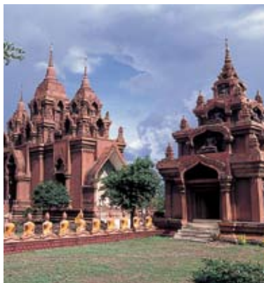
Khao Phanom Rung Fair