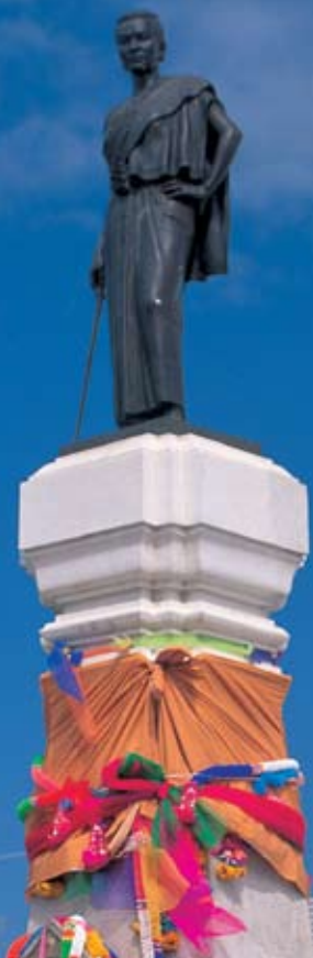
Thao Suranari Monument