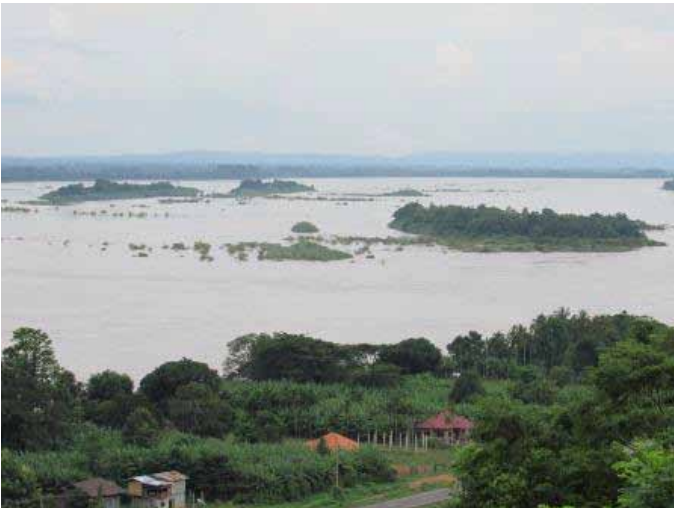
Mekong View from Vat Phou Ngoi

The view of the landscape of “Mekong Flow” from the temple is one of the best views in Champasak.