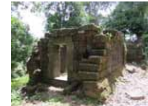
Vat Tomo, a part of Vat Phou, Khmer ancient remains