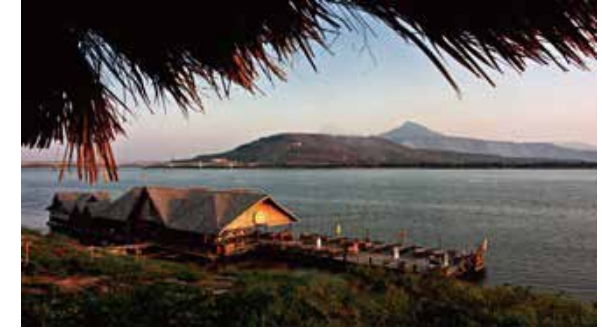
Mekong and beautiful scenery