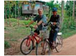
Cycling in Island