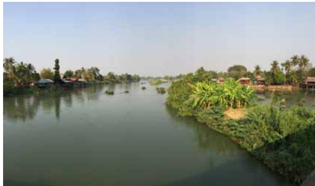
A view of the Mekong River from the bridge.

There are many cheap guesthouses near the river where you can enjoy seeing the sunset in the evening or watching the boats passing by.