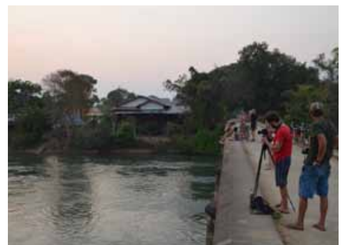
Visitors come to the bridge in the evening to take photos of the Mekong River and the sunset.

But by about 7pm the island will be very quiet as there will be no boats running and all you can hear are the muted sounds of animals by the river, especially the chirruping frogs that will form the backdrop to your evening activities.