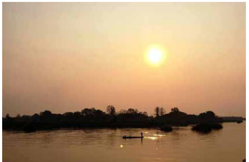
Sunset and sunrise over Don Det.

You may find that this is all you need to do to pass the day but you should not spend all your time in a hammock outside your bungalow. There are some other enjoyable things